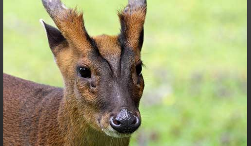
Reeves' muntjac- Franklin Park Zoo

Reeves' muntjac holders- you will be hearing from us soon!