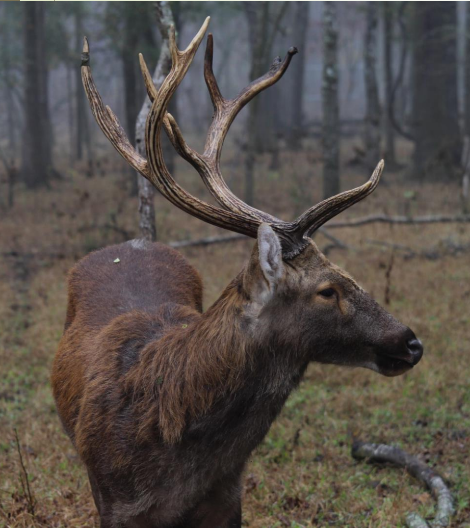
Audubon Species Survival Center