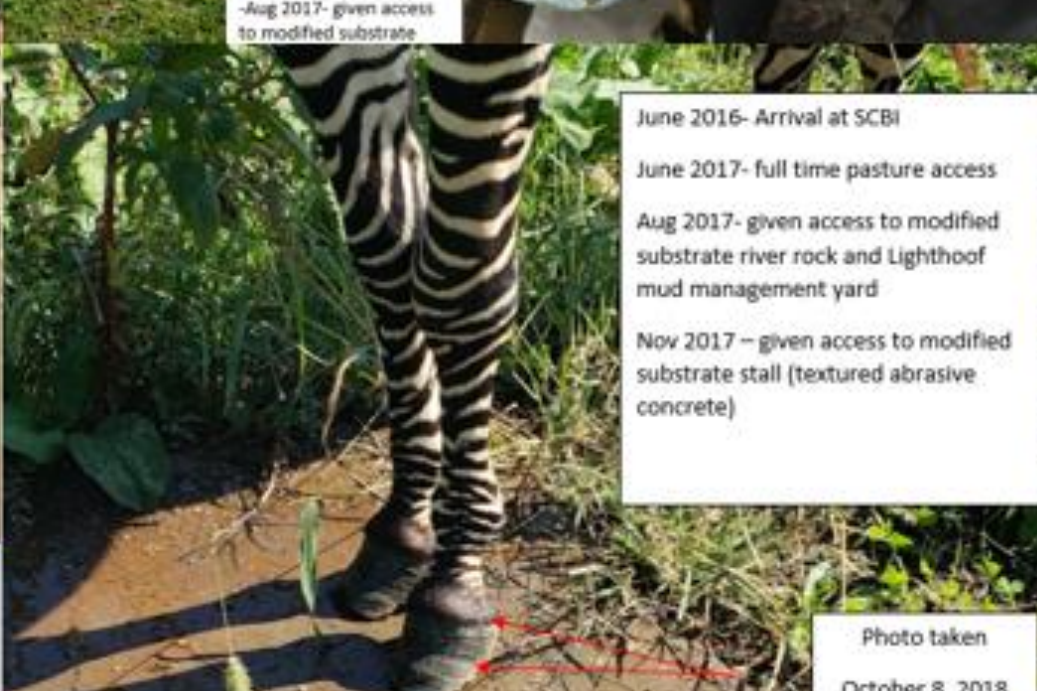
June 2016- Arrival at SCBI June 2017- full time pasture access Aug 2017- given access to modified substrate river rock and Lighthouse mud management yard Nov 2017 – given access to modified substrate stall (textured abrasive concrete)