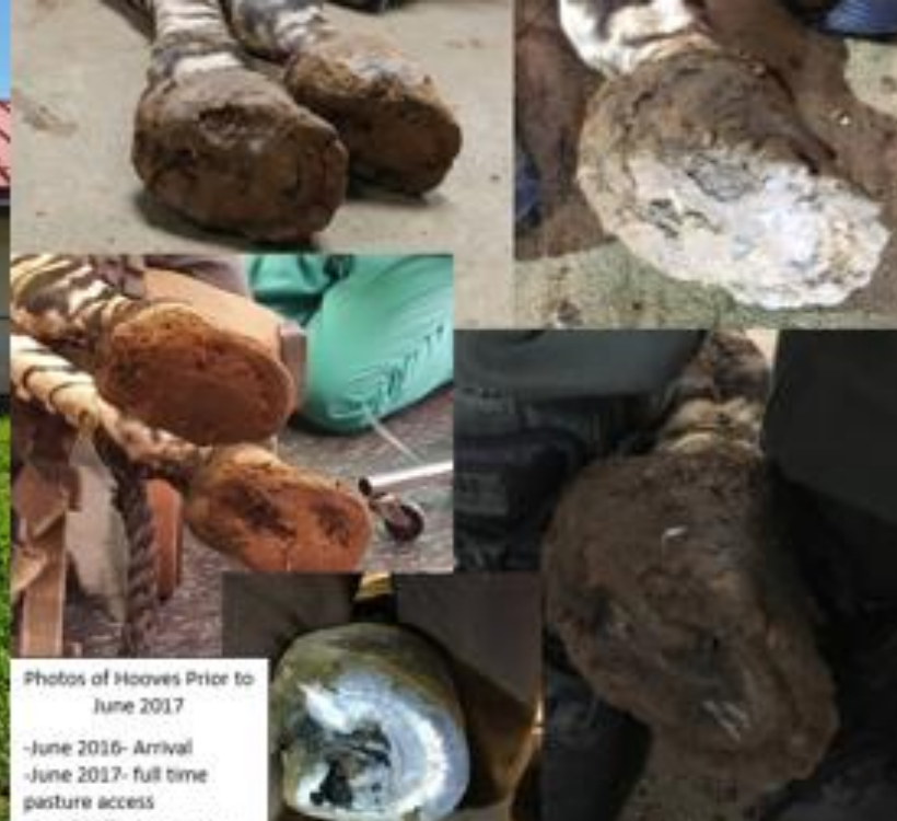
Photos of Hooves Prior to June 2017 -June 2016- Arrival -June 2017- full time pasture access -Aug 2017- given access to modified substrate