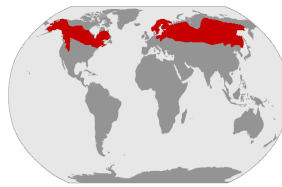
North America + Eurasia